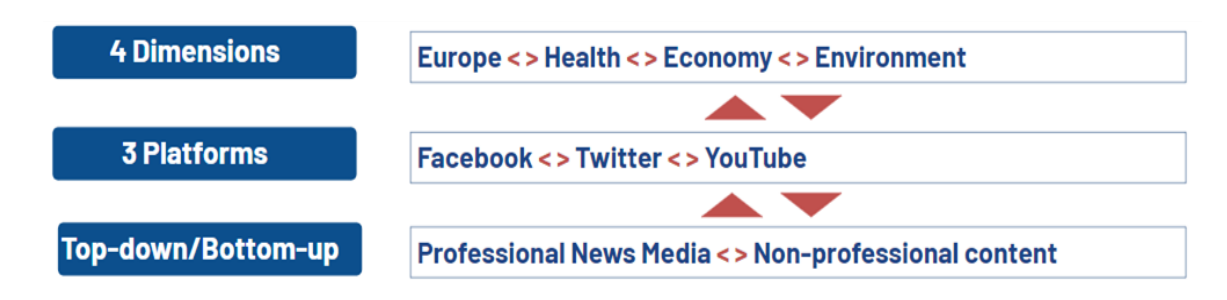
Figure 1. Synopsis of the research plan

As context, it makes sense to recall that in Italy the research period (Fall 2021) was dominated by a vibrant discussion around the COVID-19 pandemic, as well as by the economic concerns relating to the Recovery Fund. In September 2021, the law decree on the so-called "Super Green Pass" was released and published in the Official Gazette. This law extended the use of the Covid certificate to all workers, with the declared aim of encouraging higher take up of vaccinations across the population. Politicians used the opportunity offered by the COVID-19 pandemic and the introduction of the Super Green Pass, to showcase their positions in favour or against European policies, using the comparison between the restrictive measures imposed in Italy and the more or less stringent ones in place in other European countries.