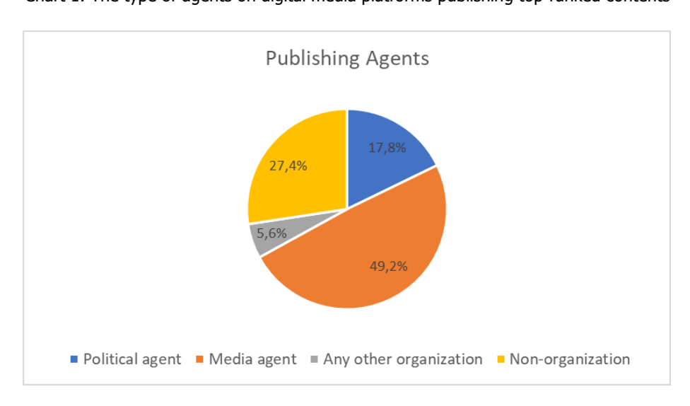
Chart 1. The type of agents on digital media platforms publishing top-ranked contents

Considering quantitative data and in regard to the most relevant posts, tweets and videos pertaining to (1) News production and Publishing agents, we found that 49% of the content is published by the legacy media; 18% by political agents (parties, politicians or groups); and only 6% by other organizations (either public institutions or private companies). It is interesting, however, that about 28% of contents are published by individual users ("Non-organization"), such as journalists, bloggers and even citizens: we can consider these contents as user-generated contents.